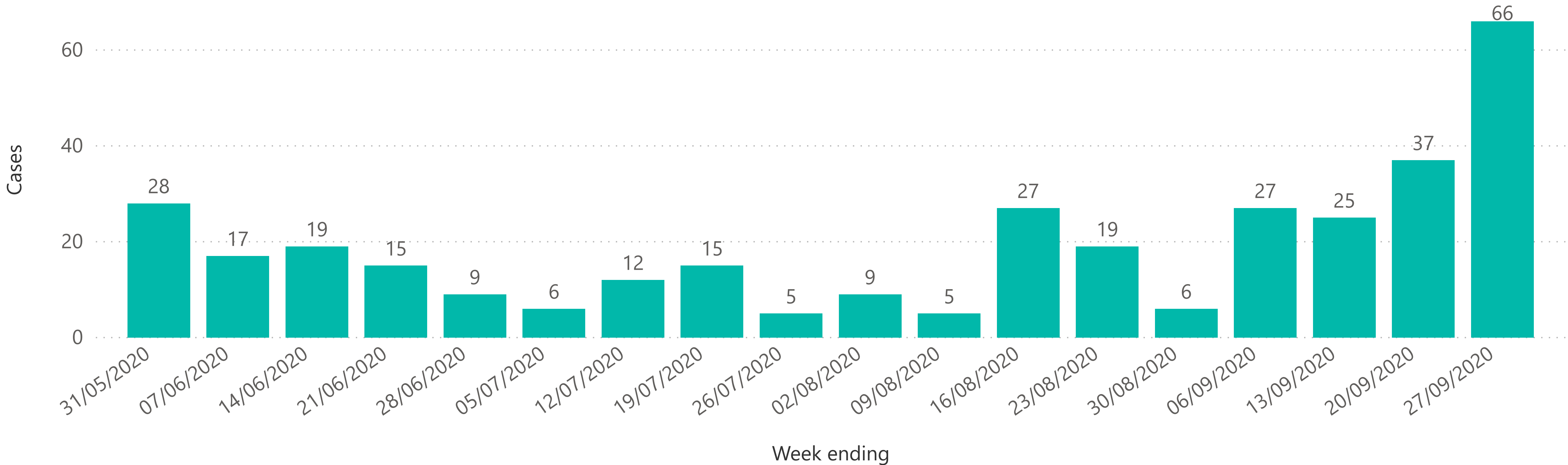
Telford and Wrekin total weekly Lab confirmed COVID-19 cases

About this data: This chart shows the number of positive cases from the end of May 2020 following the introduction of more widespread testing. Prior to this date most testing was carried out in Hospital and Care Home settings.