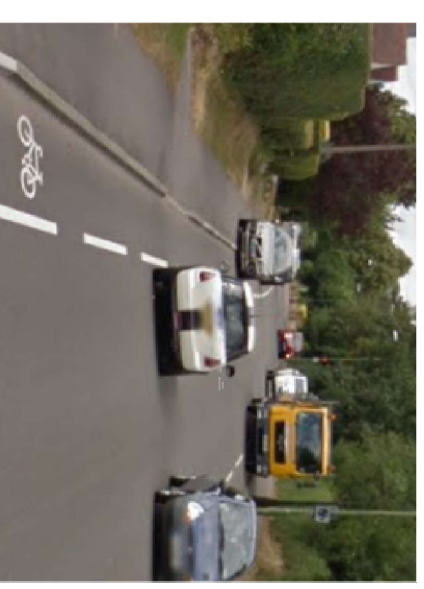
Advisory Cycle Lane