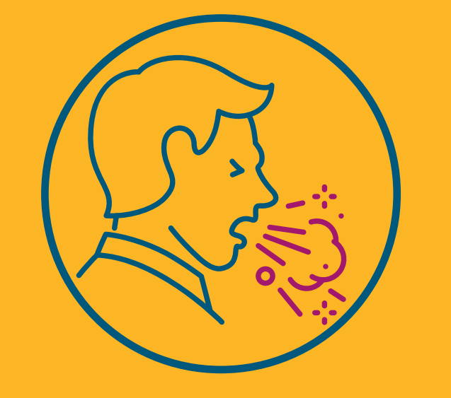
New persistent cough