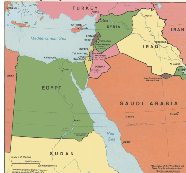
Israel and Neighboring States

When Abraham arrived in Israel, God made a promise. He said " I will give you this land for your descendants and some of them will be kings".