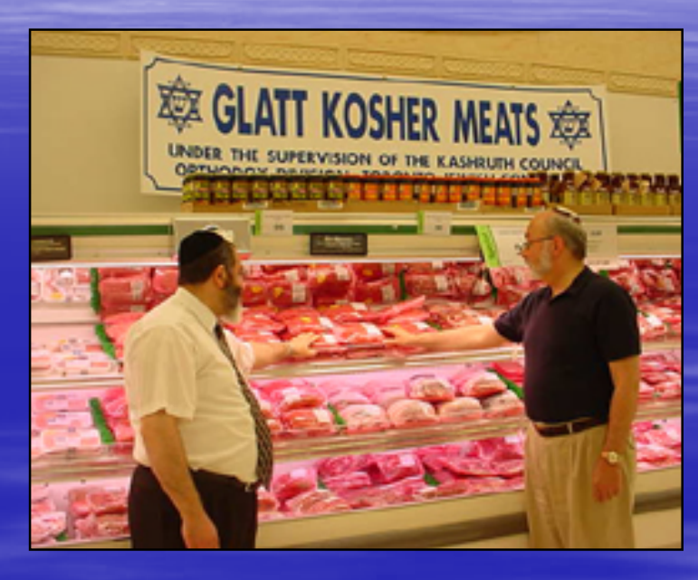
What do you think "Kosher" Means?

They tell Jewish people how to pray, what to eat and which festivals to celebrate.