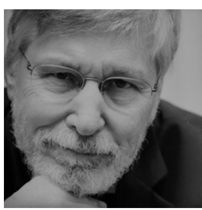
Dr Bessel van der Kolk

Bessel van der Kolk MD spends his career studying how children and adults adapt to traumatic experiences, and has translated emerging findings from neuroscience and attachment research to develop and study a range of treatments for traumatic stress in children and adults.