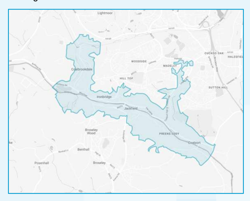
Figure 1: The Ironbridge Gorge World Heritage Site area.

The Ironbridge Gorge World Heritage Site (IGWHS) spreads over 550ha. Approximately three quarters of the area falls within the Borough of Telford & Wrekin Council.