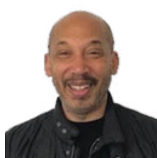
Michael Bennett Hospital and Enablement