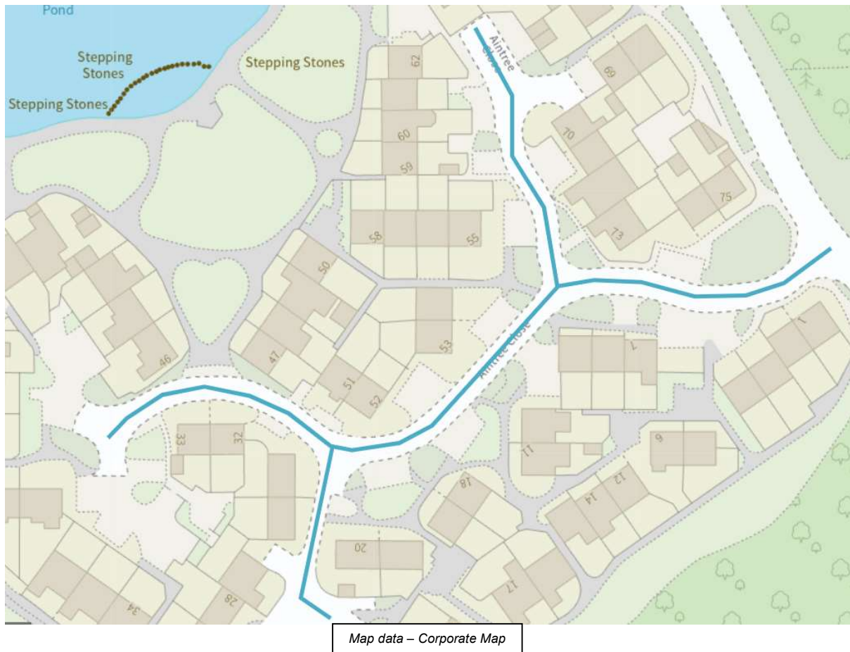
Figure 1.0 Review Area – Aintree Close (Highlighted Blue)

The review area of Aintree Close is shown in Figure 1.0