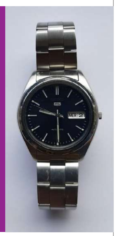
Image: watch worn by many Bosnian men and boys murdered during the genocide in Bosnia. The watch features in our Days to Remember resource.