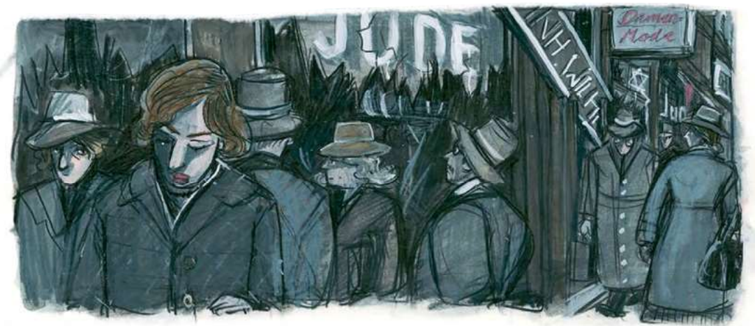
Image: illustration from Irmina by Barbara Yelin Credit: SelfMadeHero © Barbara Yelin

Our theme will also prompt us to consider how ordinary people , such as ourselves, can perhaps play a bigger part than we might imagine in challenging prejudice today.