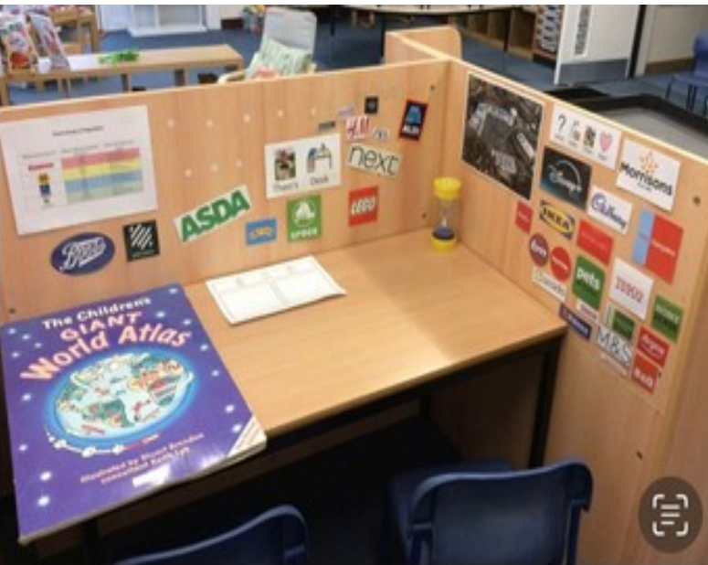
Theo's Zones of Regulation

Parents said "it's just those little accommodations and that flexibility that makes the world of difference."