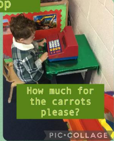
How much for the carrots please?