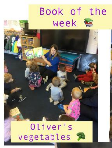
Book of the week