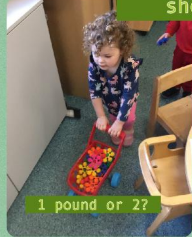
1 pound or 2?