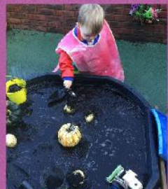
Pumpkin and veg patch