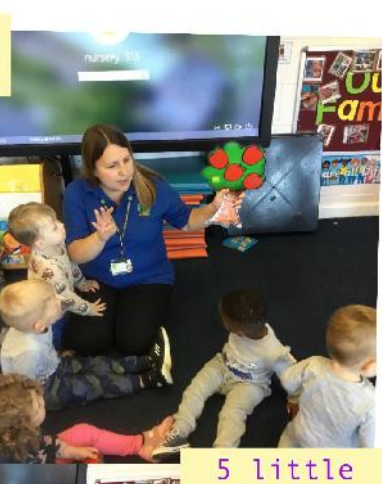
5 little apples song