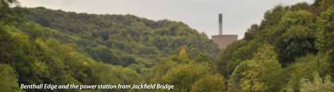
Benthall Edge and the power station from Jackfield Bridge