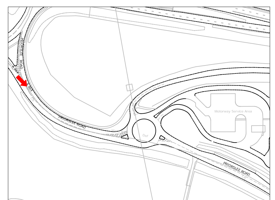
Proposed Temporary signal timings: Phase A