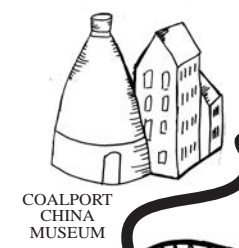
COALPORT CHINA MUSEUM