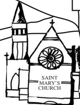
SAINT MARY'S CHURCH