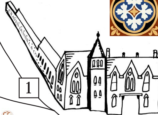
JACKFIELD TILE MUSEUM