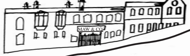
MAW & CO