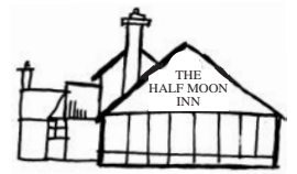
THE HALF MOON INN