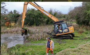
The Beeches field

IMG raised money to dredge the old pond.