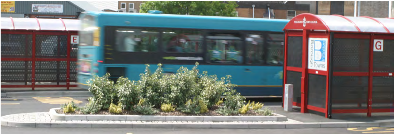
Picture 1 Wellington Bus Station

4.0.7 In 2017 the Council secured £9m of funding towards The Newport Enterprise Package, this will help deliver 950 jobs and 9 hectares of employment land, which will help meet the employment needs of the town over the life of the Local Plan. The scheme will be funded through a mix of sources including developer contributions and £6.3m from Growth Deal funding.