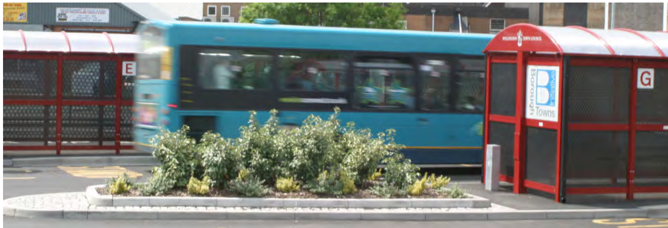
Picture 5.1 Wellington Bus Station

5.0.5 Travel Telford represents an investment programme in sustainable, low carbon, low cost transport for Telford & Wrekin. The Council were successful in securing £3.5million of DfT 'Local Sustainable Transport' funding direct from Central Government. The aim of Travel Telford has been to help to reduce the impact of pollution and carbon emissions on the local environment as well as help support and stimulate economic growth across the whole Borough. Schemes included within the programme are focused on three target areas including: