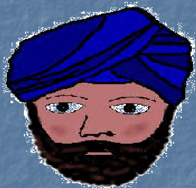
A Sikh wearing a Turban