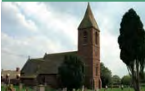
St John's parish church, Withington