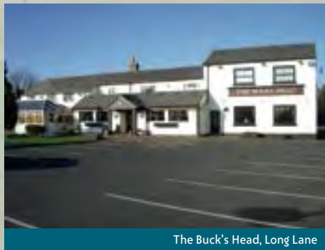
The Buck's Head, Long Lane