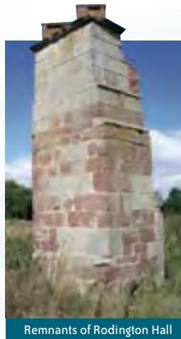
Remnants of Rodington Hall

the ancient seat of the Tayleur (pronounced tal-loo-er) family, former local landowners in the south of Rodington parish, whose presence in the district is commemorated in the name of the Tayleur Arms public house at Longdon. All that is left of the hall is a two-storey, 16th Century chimney stack, incorporating a Tudor fireplace on the ground floor of the structure. The Tayleurs apparently paid an allowance of £1 per annum to the tenants of the adjoining farm to maintain the ancient edifice that was once surrounded by a medieval moat, the last watery remnants of which were filled in around 1949. Evidence suggests an adjoining half-timbered farm building may also have belonged to the hall, while the site of its stable block could now be occupied by the Riverdale housing development in Rodington village.