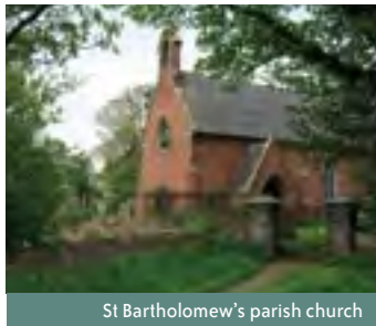
St Bartholomew's parish church

Lilleshall was plagued by regular financial crises throughout its existence and monastic officials appear to have been quick to recognise the value of the mill to the foundation. A number of documents from the 13th Century reveal evidence of grants of land along the banks of the Tern being made by local landowners to the abbot, in order that he could gain command of the river for his mill and establish a fishery for the canons nearby. Grants of this nature were not uncommon at the time, as it was often the practice for lay people to make gifts in return for the benefit of prayer. Indeed, Lilleshall appears to have acquired a number of properties in this way. Once established, the abbey's rights to the waterway were jealously guarded, as in 1251 when a writ was issued against the abbot of Buildwas Abbey for unlawfully throwing down a stank at Longdon. Long Mill, as it seems to have been known, remained with Lilleshall until its dissolution in 1538, although nothing of the medieval structure survives, with the current mill building dating from the early 19th Century.