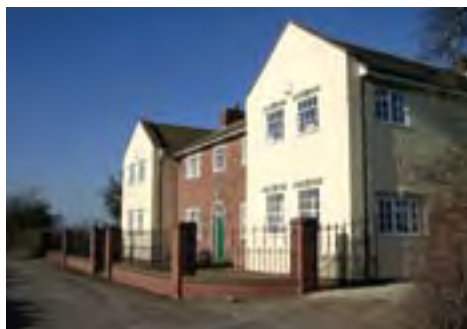
The former Tiddicross Parish Workhouse

Tiddicross Field, situated to the west of Wrockwardine on the road to Charlton, was purchased for charitable purposes in 1657, when the rents of the property, upon which a house and barn were later built, were divided annually between the poor of the parish. The cost of relieving local poverty rose rapidly during the 17th and 18th Centuries and in 1782 the parish authorities were forced to rent a cottage in which to house the local poor. However, most people requiring assistance received it outside the institution, through cash payments and goods in kind. At that time, the parish included the detached settlement of Wrockwardine Wood, where the need for aid proved to be particularly heavy and was often linked to downturns in local industry.