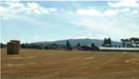
Charlton village and The Wrekin

The tiny settlement of Charlton, situated halfway between Wrockwardine and Walcot, shows few obvious traces of the prominent position it once enjoyed locally. Yet, in a field on the edge of the village, standing within a large moated enclosure, the ruins of a fortified manor house built by a distinguished 14th Century knight who served at the court of an English monarch provide enduring evidence of the former importance of this secluded site.