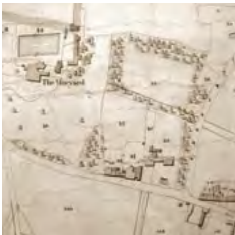
The Vineyard and Mansion House Lane in 1841