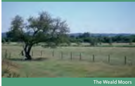
The Weald Moors