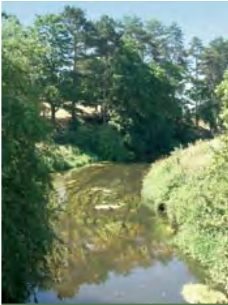
The Tern Valley at Walcot