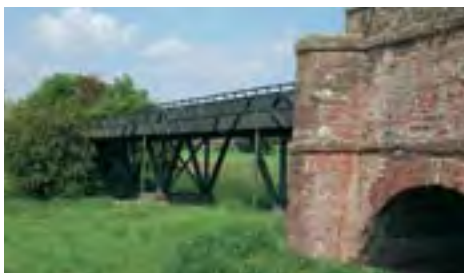
The end of Clowes' stone aqueduct (right)