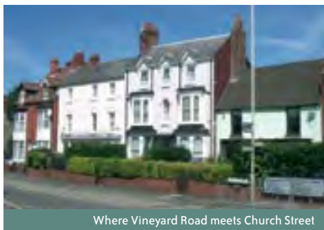
Where Vineyard Road meets Church Street

Until the early 19th Century, Vineyard Road and the area of Springhill stretching to the junction of Admaston Road were known as Mansion House Lane. Many of Wellington's wealthiest and most influential families lived in this area and a number of the fine properties they inhabited still stand as a reminder of the grandeur once associated with this exclusive Wellington address.