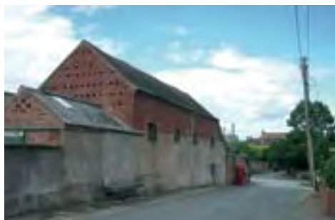
The Bull Ring

The former canalside village of Rodington is an ancient rural community standing on the banks of the River Roden, the waterway from which the settlement probably took its name. Despite its tranquil appearance, Rodington has a surprisingly lively past and, when Telford drove the Shrewsbury Canal through the area in the late 1700s, the village Bull Ring was the site of a barbaric annual festival of blood and gore.