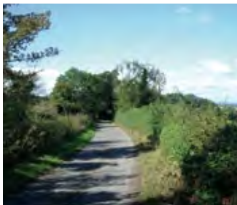
On the road to the workhouse