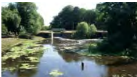
Confluence of the Tern and Roden at Walcot

Possible Iron Age enclosures to the south of the River Tern suggest a long history of habitation in the area surrounding Walcot. Indeed, the village appears to have been a notable settlement since early Anglo-Saxon times and its name may denote status as a village where Welsh was still spoken at the time it belonged to Wreosensaete, the 8th Century sub-kingdom of Mercia. By Domesday, Walcot was reckoned to be an outlying farmstead of Wellington, where that manor's mill may have been situated. Milling continued to play an important role in village life until the early years of the 20th Century; the mill itself was demolished in 1961. However, near to the Tern, the mill race can still be seen, while the southern end of the bridge over the river is notable as the last edifice to be designed by William Hayward, architect of the Thames Bridge at Henley.