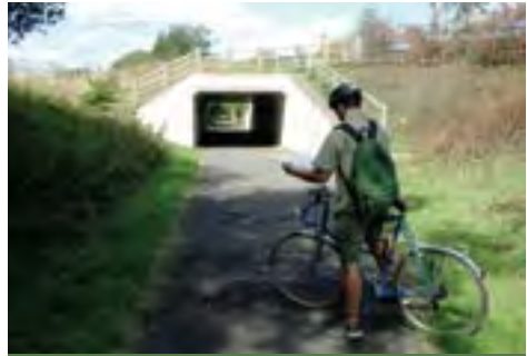
Traffic-free cycling on the Tern Valley Trail

To follow the Tern Valley Trail just refer to the route map in the centre of this booklet. There are also focus maps on alternate pages containing additional details of lost heritage features along the way and plenty of opportunities to take a break at family-friendly pubs en route. Just remember to bring your imagination and always follow the Highway Code.