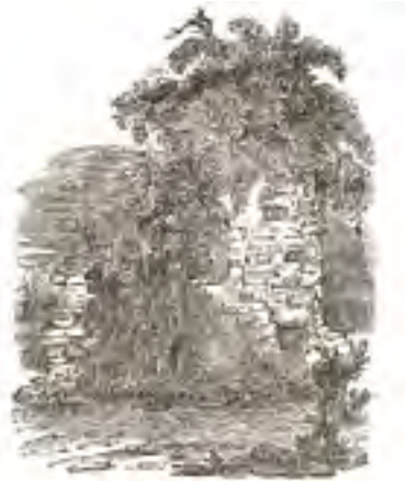
Charlton Castle ruins in 1857