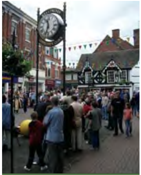
Wellington Midsummer Fair, Market Square

Between 1795 and 1796, Thomas Telford drove the Shrewsbury Canal through the lower Tern Valley near Wellington, rendering many changes to the local landscape that can still be viewed today. The year 2007 marks the 250th anniversary of the renowned Scottish civil engineer's birth, so what better way to witness his impact in east Shropshire than to get out and see some of the changes he made first hand? Along the way you'll uncover groundbreaking industrial heritage, medieval castle ruins, secret Second World War history and much more besides, so come with us now and discover the riparian wonders of the Tern Valley.