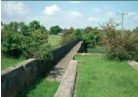
Inside the iron trough