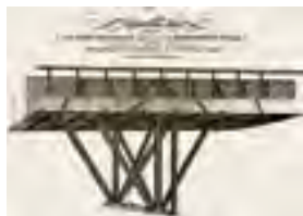
Original drawing of the aqueduct

Longdon Aqueduct is the oldest surviving cast iron structure of its kind in the world but was not the first to be built. A few weeks before its completion, in February 1796, the much smaller Holmes Aqueduct, designed by the civil engineer Benjamin Outram, opened on the Derby Canal. Sadly, this historic structure was demolished in 1971.