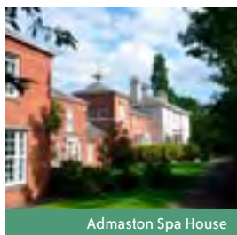
Admaston Spa House

complaints and it is possible people visited the site since medieval times, when a holy well may have existed here. Despite its appeal to late Victorian ideals on healthy living, the popularity of the spa was short-lived and, by the 1890s, it had closed. The spa house, which later became a chicken farm, was restored to private ownership in the 1970s.