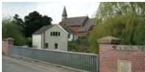
St George's Church and Roden Bridge

from 1839 also protests at the presence of a beerhouse in Drury Lane, where local servants were allegedly encouraged to 'tipple all night'!