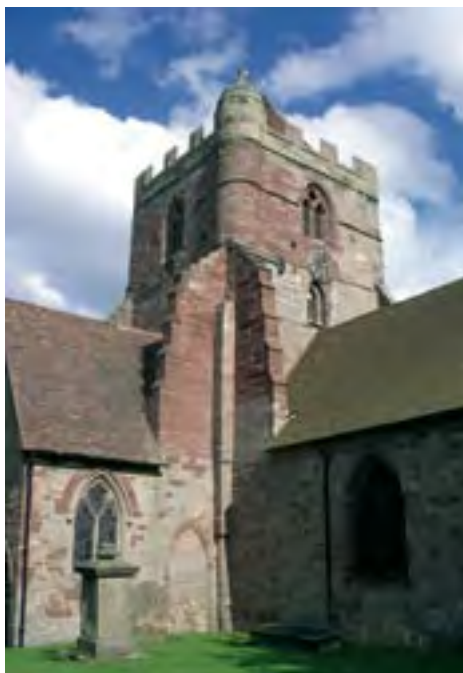
St Peter's parish church, Wrockwardine