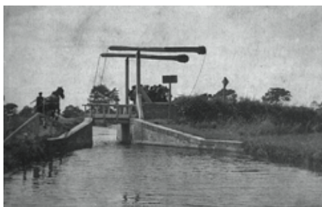
Lift Bridge near Rodington

By the late 18th Century, Shrewsbury was largely dependant on the many mines centred around the Oakengates area for its coal supplies. In fact, the sheer volume of traffic used for transporting raw materials to the county town had rendered the Holyhead Road all but impassable in places and an alternative was sought in 1792 when a potential route for a new canal was first surveyed.