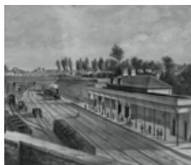
Wellington Station in the mid-19th century

The Wellington and Drayton Railway was first incorporated in 1862 and a 16-mile line linking the two market towns was eventually completed, after several delays, in October 1867. Little fanfare appears to have accompanied the opening of the railway, although a celebratory dinner was organised by its contractors, Messrs Brassey and Field, at the Wrekin Hotel in Wellington's Market Square where, according to the Wellington Journal , 'some good songs were sung