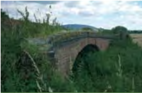
No. 26 Canal Bridge, Rodington

Building the Shrewsbury Canal presented few real challenges in the way of difficult terrain or severe gradients yet, owing to its connections with the canal network serving the east Shropshire coalfield, it retained a number of unusual features. The new waterway was designed to accommodate the same tub-boats that plied along that system, rendering it unusable to standard narrowboats until a widening program took place during the 1830s. At Trench, a 223 yard inclined plane drew vessels up and down from the existing canal 75 feet above via rail but the utilisation of unconventional engineering methods did not end there. The locks on the Shrewsbury Canal were, at just 6 feet and 7 inches, the narrowest in Britain and, at 81 feet long, could accommodate up to four boats at a time. ‘This is accomplished’, wrote Telford, ‘by having gates that are drawn up and let down perpendicularly’; it was this feature that gave these unusual devices the name ‘Guillotine Locks’.