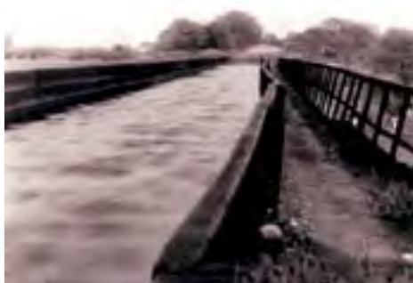
The aqueduct in water (circa around 1950)

the iron plates for the frame of the structure. Using the surviving ends of Josiah Clowes' water ravaged edifice, a trough and separate towing path measuring 62 yards in length were slotted into place on knee-braced supports just 16 feet above the Tern Valley. Although Longdon Aqueduct is now a scheduled ancient monument, its principal value lies in the influence it had on Telford's later work. The experience he gained from using iron at Longdon was to prove invaluable in the construction of the Pontcysyllte Aqueduct on the Llangollen Canal, one of the great engineering triumphs of the canal age.