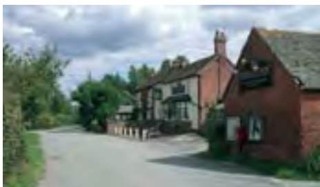
The Hare and Hounds, Withington