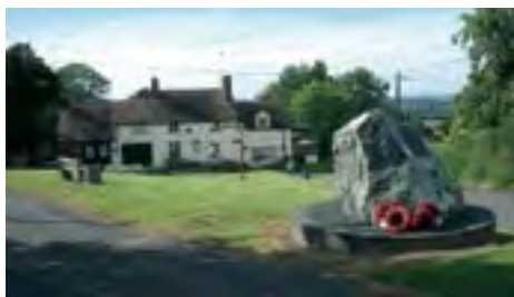
The Green, Wrockwardine

To add to the air of mystery surrounding the area's lineage, The Tribal Hidage , an Anglo-Saxon tax record that may have been compiled within 100 years of the supposed fall of Pengwern, records Wrockwardine as belonging to the Wreosensaete ('the people of The Wrekin') which was then a sub-kingdom of the larger Anglo-Saxon state of Mercia. Other evidence from the period suggests the word 'saete' may have been used to denote former British kingdoms, providing another tantalising clue to Wrockwardine's regal past.