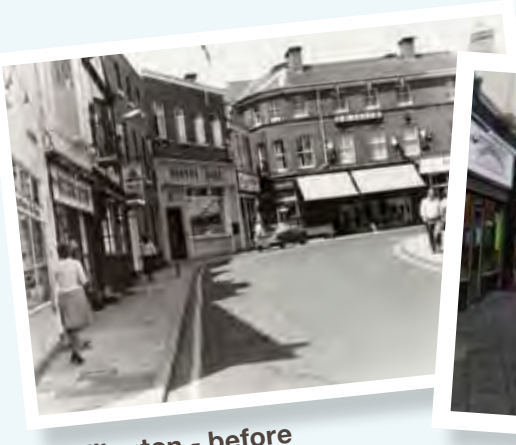
Wellington - before