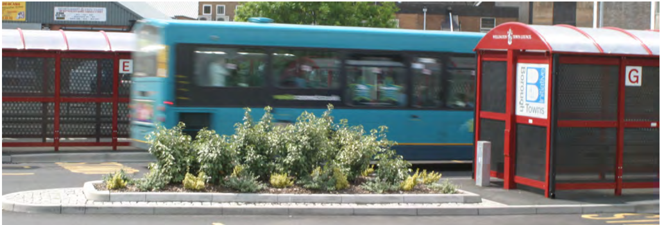
Picture 4.1 Wellington Bus Station

4.0.5 The Council have been successful in securing £22.6m of funding towards highway network and other infrastructure improvements as part of the Marches Local Enterprise Partnership, Growth Deal. The Telford Growth Points Package represents a major investment to be targeted at key junction improvements on the highway network between 2015-2017 including capacity enhancements at 7 key roundabout's and junctions on the highway network. The investment is expected to help deliver approximately 5,400 jobs and 2,800 houses. £3.6m of funding has also been secured towards the Eastern Gateway scheme which will see improvements to the capacity of junction 4 of the M54.