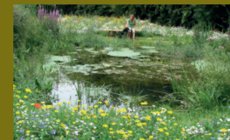
Pond planting for wildlife