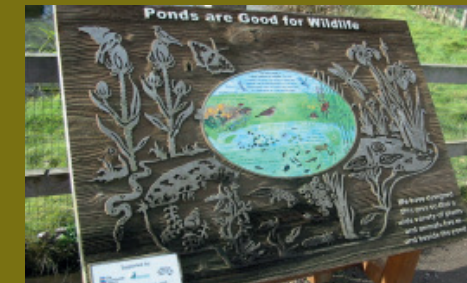
Interpretation boards about wildlife and heritage