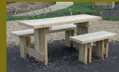
Wheelchair accessible picnic benches