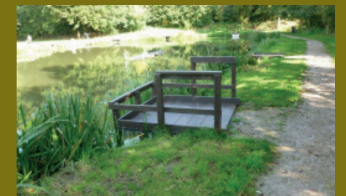
Wheelchair accessible fishing pegs