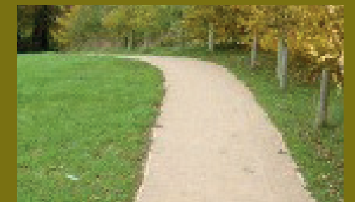
All-access surfaced path