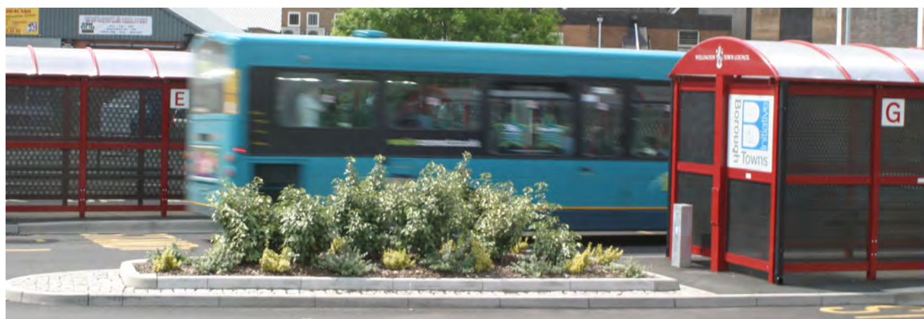
Picture 4.1 Wellington Bus Station

4.0.4 The Local Sustainable Transport Fund (LSTF) is a programme launched by government in January 2011. It was established in support of the Local Transport White Paper 'Creating Growth, Cutting Carbon: Making Sustainable Local Transport Happen'. It will provide £560 million over the next 4 years for local highway authorities to deliver sustainable transport improvements in their areas which will meet the primary objectives of supporting economic growth and achieving carbon reduction.