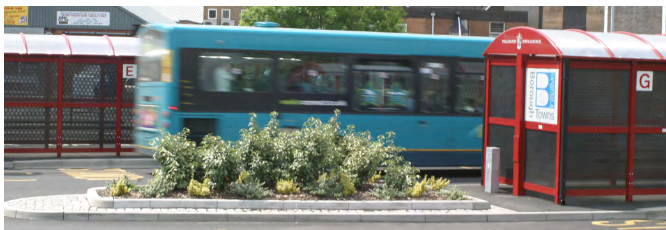
Picture 4.1 Wellington Bus Station

4.0.4 The Local Sustainable Transport Fund (LSTF) is a new programme launched by government in January 2011. It was established in support of the Local Transport White Paper 'Creating Growth, Cutting Carbon: Making Sustainable Local Transport Happen'. It will provide £560 million over the next 4 years for local highway authorities to deliver sustainable transport improvements in their areas which will meet the primary objectives of supporting economic growth and achieving carbon reduction.